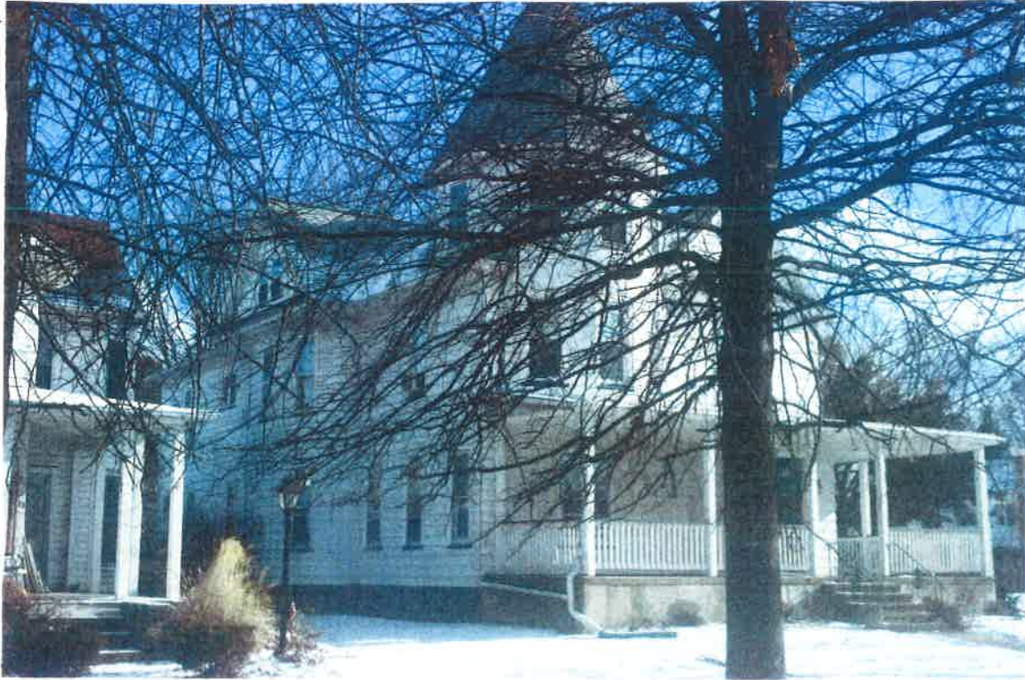
FRONT LEFT 1/24/13 REAR 1/24/13

If using the Elevation Certificate to obtain NFIP flood insurance, affix at least 2 building photographs below according to the instructions for Item A6. Identify all photographs with date taken; "Front View" and "Rear View"; and, if required, "Right Side View" and "Left Side View." When applicable, photographs must show the foundation with representative examples of the flood openings or vents, as indicated in Section A8. If submitting more photographs than will fit on this page, use the Continuation Page.