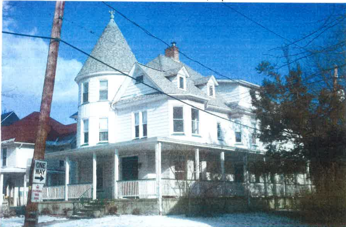
FRONT RIGHT 1/24/13