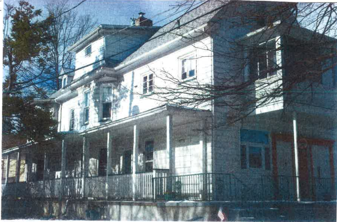
REAR LEFT 1/24/13

If submitting more photographs than will fit on the preceding page, affix the additional photographs below. Identify all photographs with: date taken; "Front View" and "Rear View"; and, if required, "Right Side View" and "Left Side View." When applicable, photographs must show the foundation with representative examples of the flood openings or vents, as indicated in Section A8.