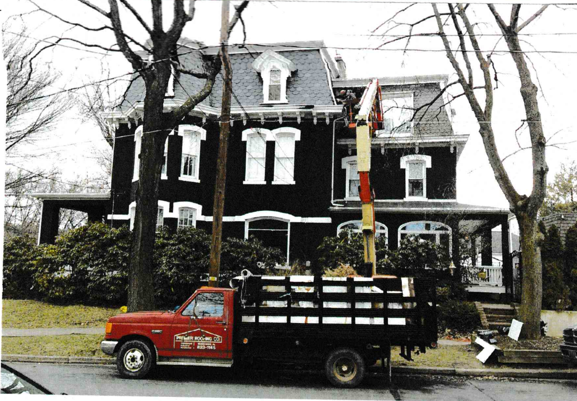
LEFT SIDE 4/8/14

If submitting more photographs than will fit on the preceding page, affix the additional photographs below. Identify all photographs with: date taken; "Front View" and "Rear View"; and, if required, "Right Side View" and "Left Side View." When applicable, photographs must show the foundation with representative examples of the flood openings or vents, as indicated in Section A8.